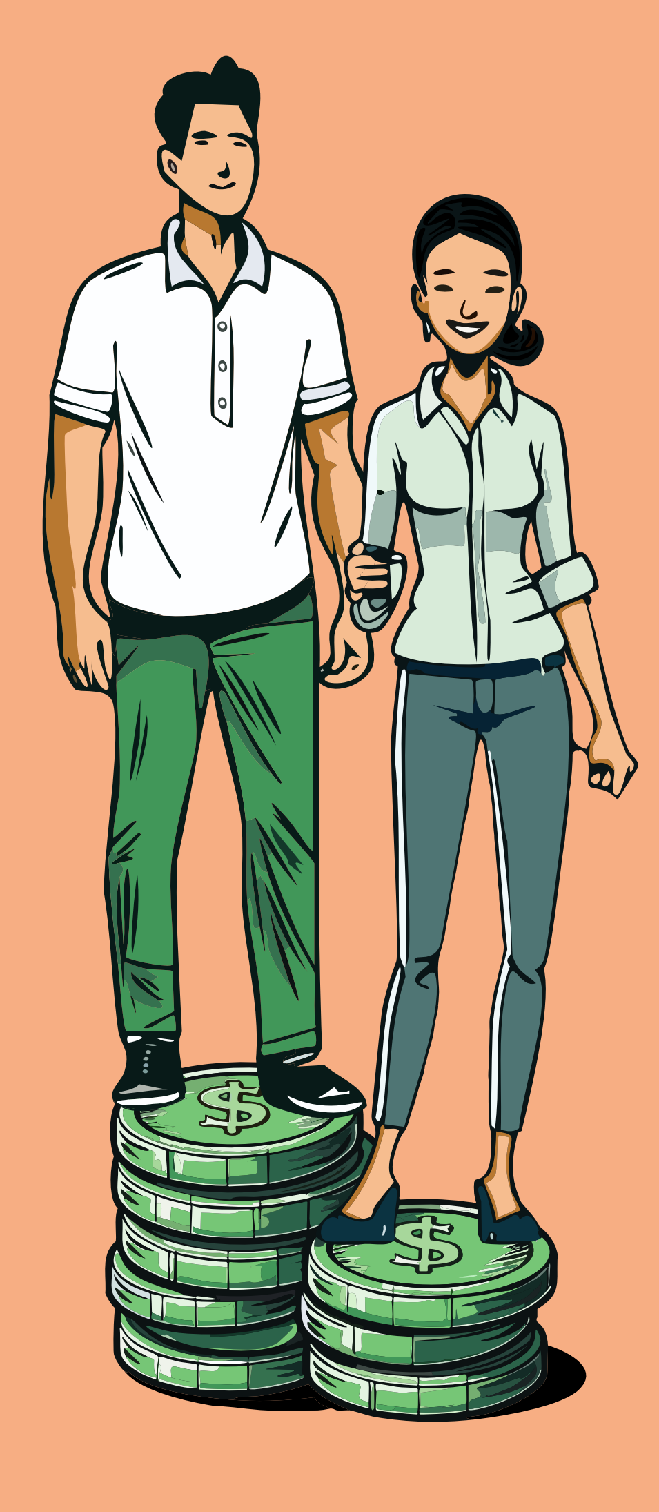
Mean 63% Median 16%