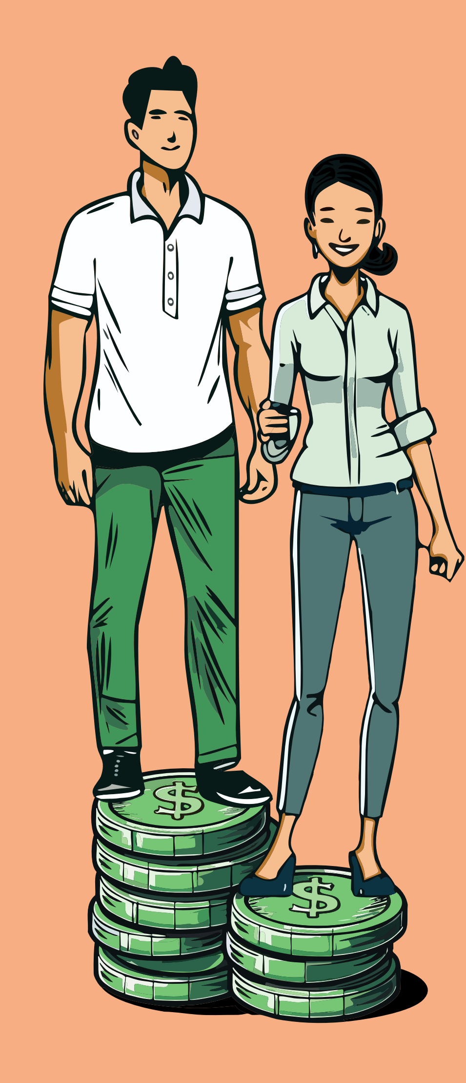
Mean 7.8% Median 2.25%