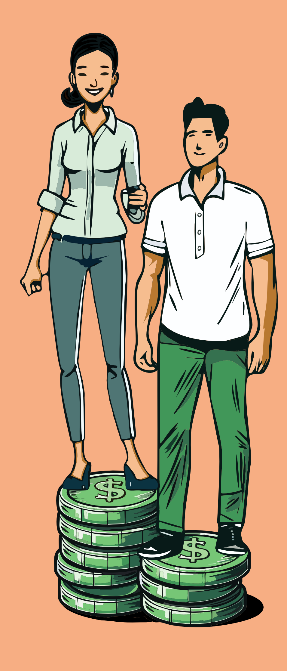
Mean 0.1% Median 1.09%